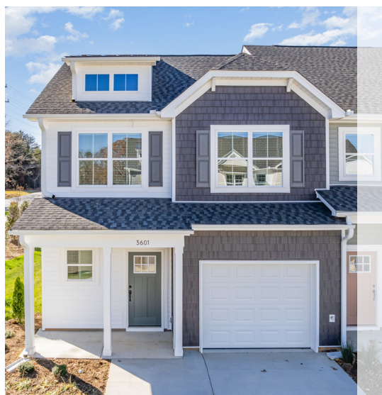
THE FRISCO RIGHT SIDE GARAGE