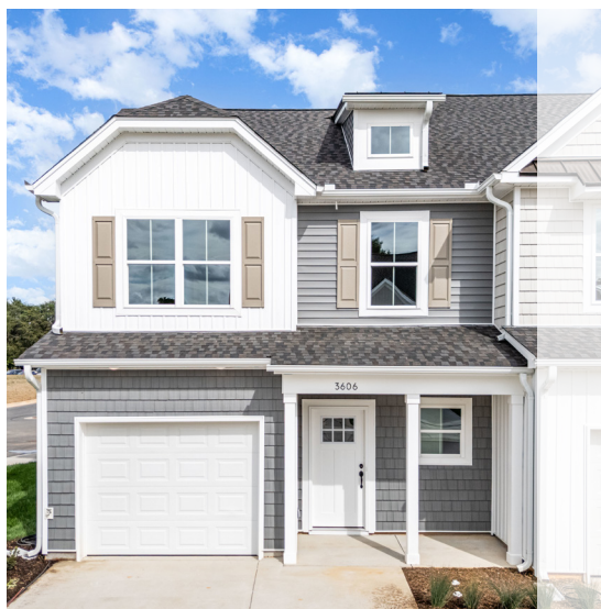
THE FRISCO LEFT SIDE GARAGE

1,662 | 3-4 | 2.5 Main Level Primary Suite