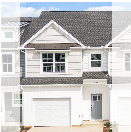
THE GIBSON LEFT SIDE GARAGE