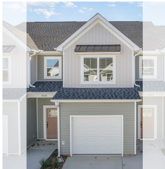
THE GIBSON RIGHT SIDE GARAGE