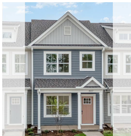
THE HARTFORD INTERIOR UNIT