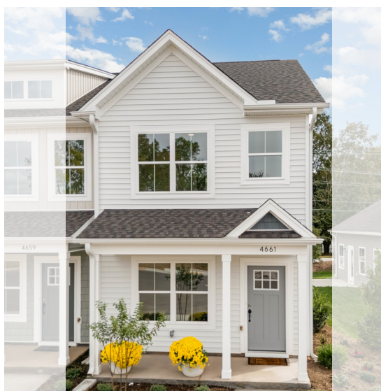
THE HARTFORD END UNIT